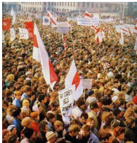
Figure 2: Pro-Independence Demonstration in Minsk, August 1991 9

Both in Ukraine and Belarus, the movements remained a minority, though while in Ukraine they were catalysed by the 1991 Coup and gained further popularity 6 , in Belarus this never happened. Why was this, and was it really due to the radicalness of their program, as it is frequently described 7,8 ?